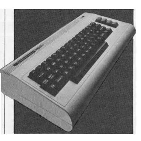
VIC 20 Personal Computer

A: A retrofit kit number 9000029 is needed on original double-board SuperPETs to run 8032 programs using ROM slots UD 11 and UD 12. This kit is available at no charge from an Authorized Commodore Dealer.