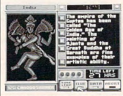
Follow Carmen through geography and time in her latest caper.

a valuable book you use to investigate clues. The first three titles in the series included the World Almanac and American and European travel guides. You'll find The New American Desk Encyclopedia in Where in Time .